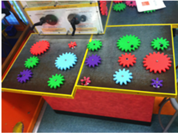
Figure 1. Gear exhibit set up.